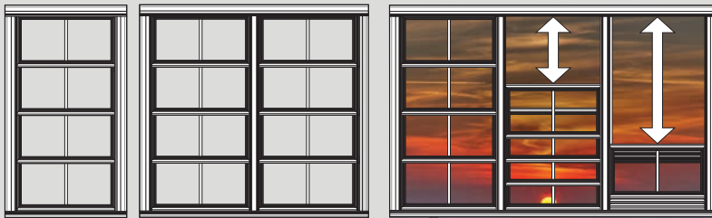
Single Window System 2ft - 4ft

WeatherMaster® Windows are made from ViewFlex vinyl that is available in 4 different tints, allow for 75% ventilation, and are a virtually maintenance free window system. With a variety of products and colors to choose from to suit your specific needs and custom applications, WeatherMaster® products are an economical way to expand the functionality of any space while adding beauty and value to your home.