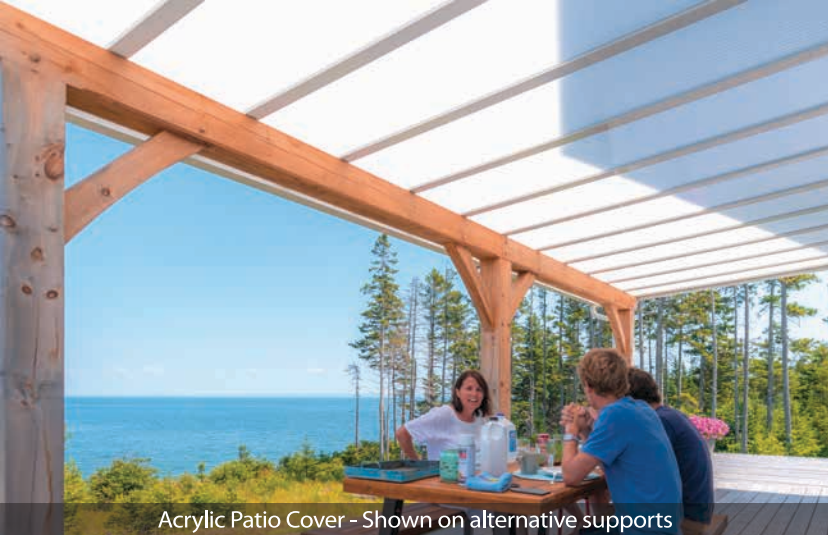
Acrylic Patio Cover - Shown on alternative supports