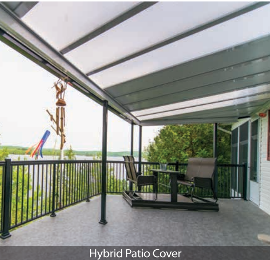
Hybrid Patio Cover