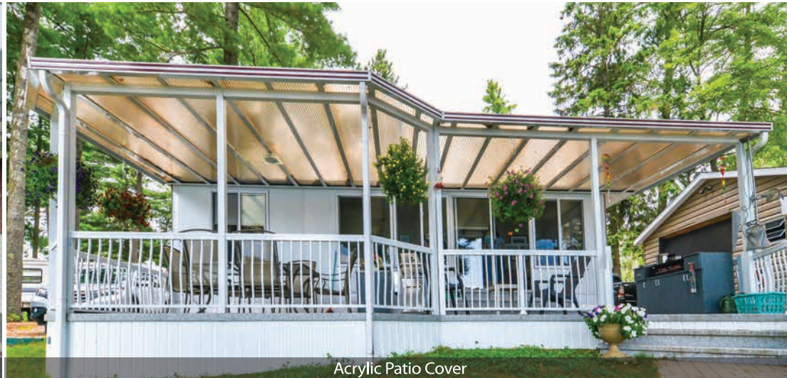
Acrylic Patio Cover