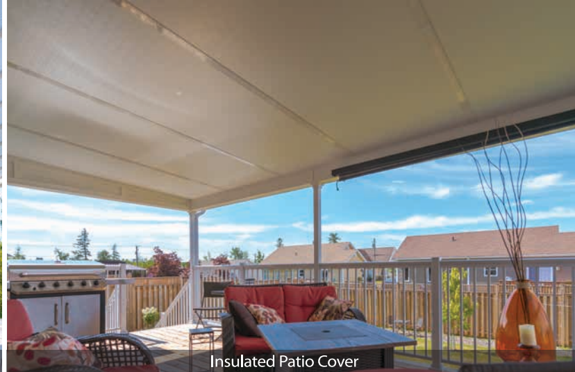
Insulated Patio Cover