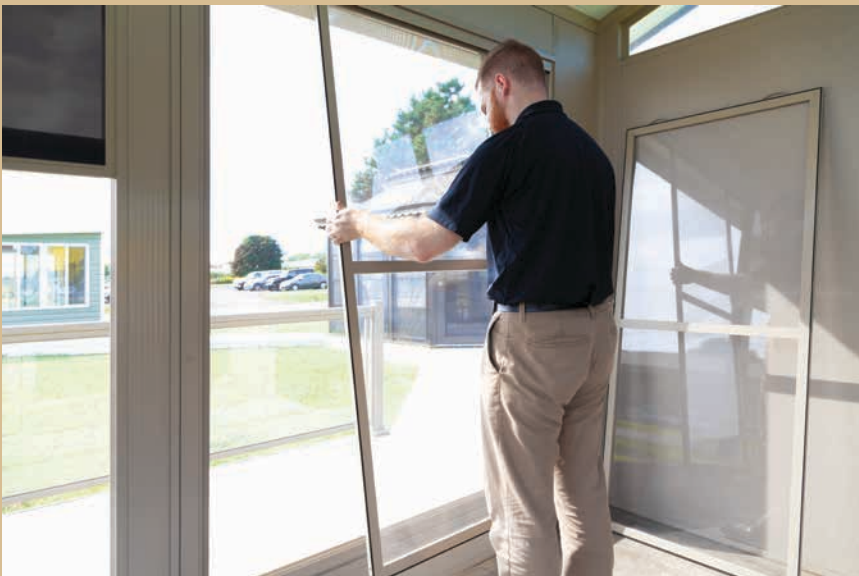
Spring loaded vents lift out easily for simple cleaning & storage